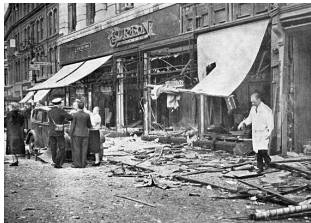
Aftermath of the bombing in Broadgate, one of the principal shopping streets in pre-War Coventry.