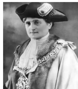
Alice Arnold, Mayor of Coventry, 1937