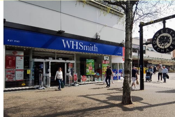
Smith and Jones (above and below), Smithford Way.

The historic retailer has quit the UK high street and sold its 480 stores to Modella Capital, owner of Hobbycraft, for £76 million. Smith's said the move will allow it to focus on its travel shops, meaning that WH Smith will retain and extend its presence in railway stations and airports. But the brand will disappear from the high street and Modella has already started to rebrand its newly acquired stores as TG Jones.