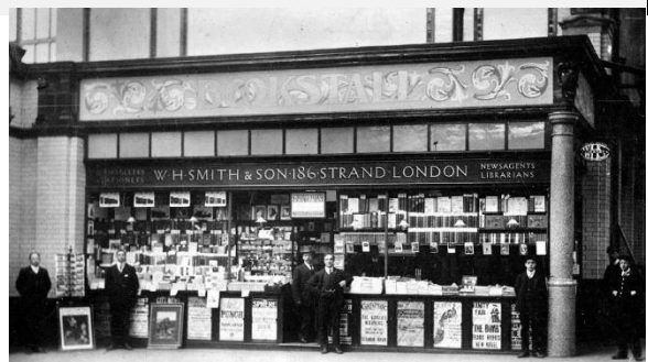
Victoria Station, Manchester, c1932.