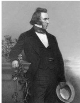
Joseph Paxton, National Portrait Gallery London