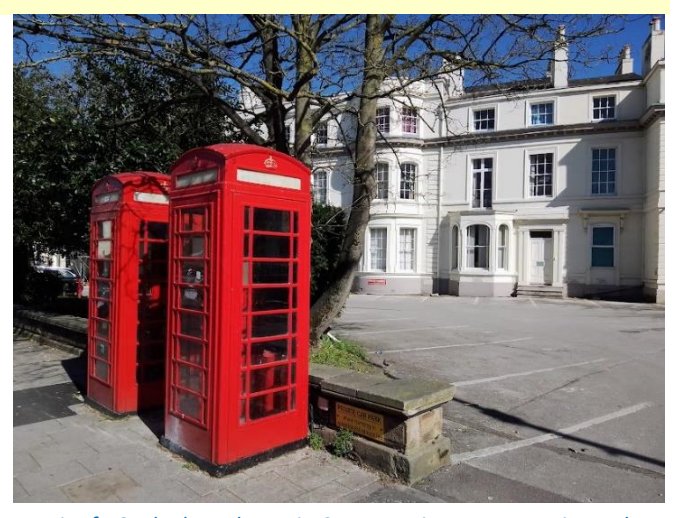
A pair of K6 telephone boxes in Coventry city centre, not in use but "protected for future generations".

The red telephone box in Britain was designed by Sir Giles Gilbert Scott, whose major claim to