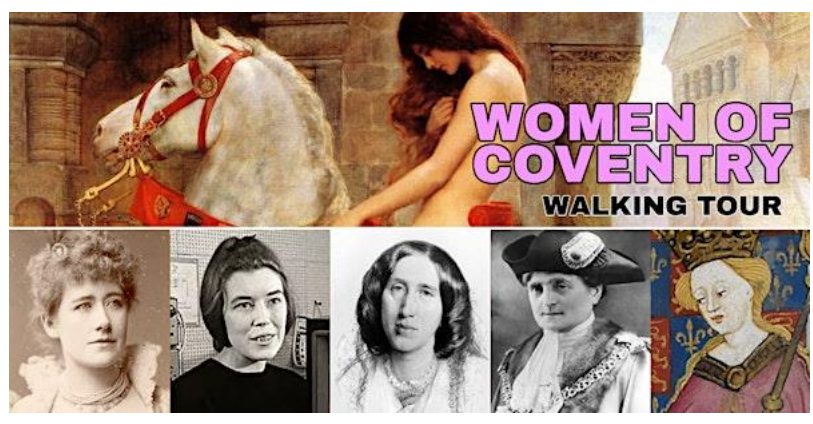
Graphic image: Adam Wood

The walk aims to celebrate "some of the visionary and extraordinary women who have shaped the city's history" and will include visits to numerous city centre