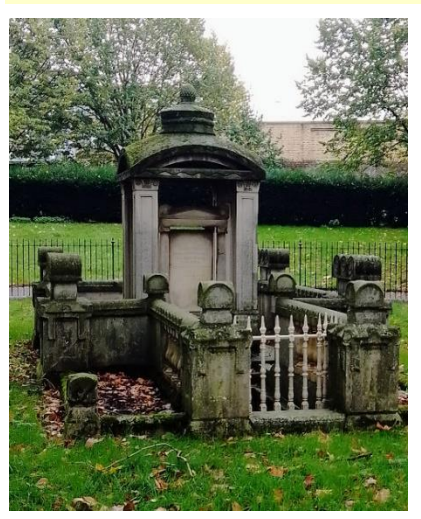
Sir John Soane's mausoleum in the gardens of St Pancras Old Church, London – thought to be the inspiration for the dome shape red telephone box.

fame was the design in 1903 of Liverpool's Anglican Cathedral - a commission he won when he was only 22 years old. The cathedral was consecrated in 1924 but not completed until 1978. Scott was also the architect for Battersea Power Station in the 1930s and he might have become the architect for the new Coventry Cathedral, had his design in 1944 not been rejected by the Royal Fine Arts Commission.