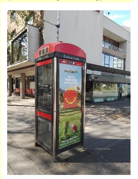
This box outside the Belgrade Theatre is a KX Plus, a design first adopted in 1996. Its most notable feature is the red dome roof, reminiscent of the K6 box.

In 2015 the traditional red phone box was voted the greatest British design of all time, ahead of the Routemaster bus, the Spitfire, the Union Jack and Concorde. Around 2,000 became 'listed buildings', including