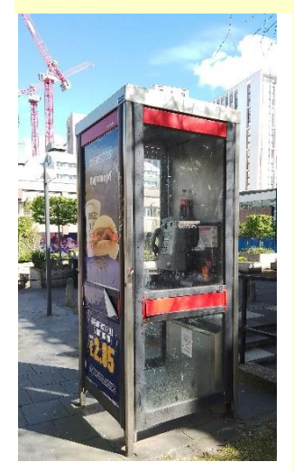
Phone box in Priory Street an example of the simple design favoured by BT from the mid-80s onwards.

In 1935, when the K6 was first introduced, there were 19,000 public phone boxes in Britain and by 1940, thanks to the success of the K6, this had risen to 35,000. By 1960 there were 64,000 red kiosks in Britain.