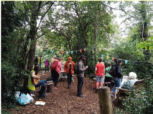
Visitors explore Kingsfield Orchard during last year's Heritage Open Days, with apple juice and music (below).

A HIDDEN gem in Stoke, close to Gosford Green, will open for one afternoon during Heritage Open Days – on Sunday September 15 th , between 2 and 4pm.