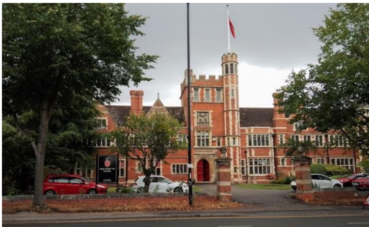
King Henry VIII School: open for tours.

Dalecote House in Warwick Road, an imposing late Victorian house built in 1878 for the Twist family (multi-generation solicitors of Coventry) which retains many of its original architectural and design features. It's now used as a meeting place for Coventry's Freemasons, guilds and other charities. The whole building will be open, including the masonic lodge. It can be found on Warwick Road, next to the Leamington Road junction, close to the Memorial Park. It's open on Friday, Saturday and Sunday, September 13-15 th , from 9.30 to 5.30pm.