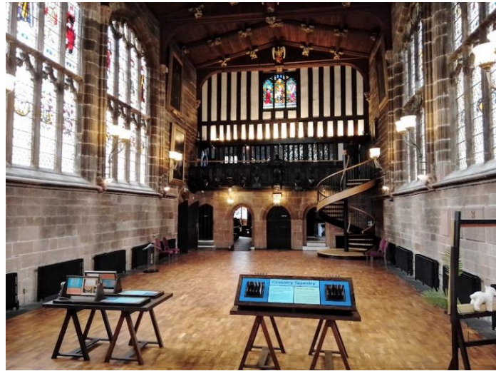
Inside St Mary's Guildhall: entry is free on Saturday and Sunday, September 14-15, 10-4pm.

Places featured in Coventry include the city's major visitor attractions such as Coventry Cathedral , St Mary's Guildhall , Coventry Transport Museum and the Herbert Art Gallery and Museum . But many other places will also be open, some of which are less well known. Some of the highlights include: