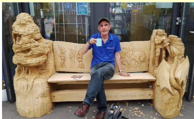
The hand-carved story bench at Tile Hill.