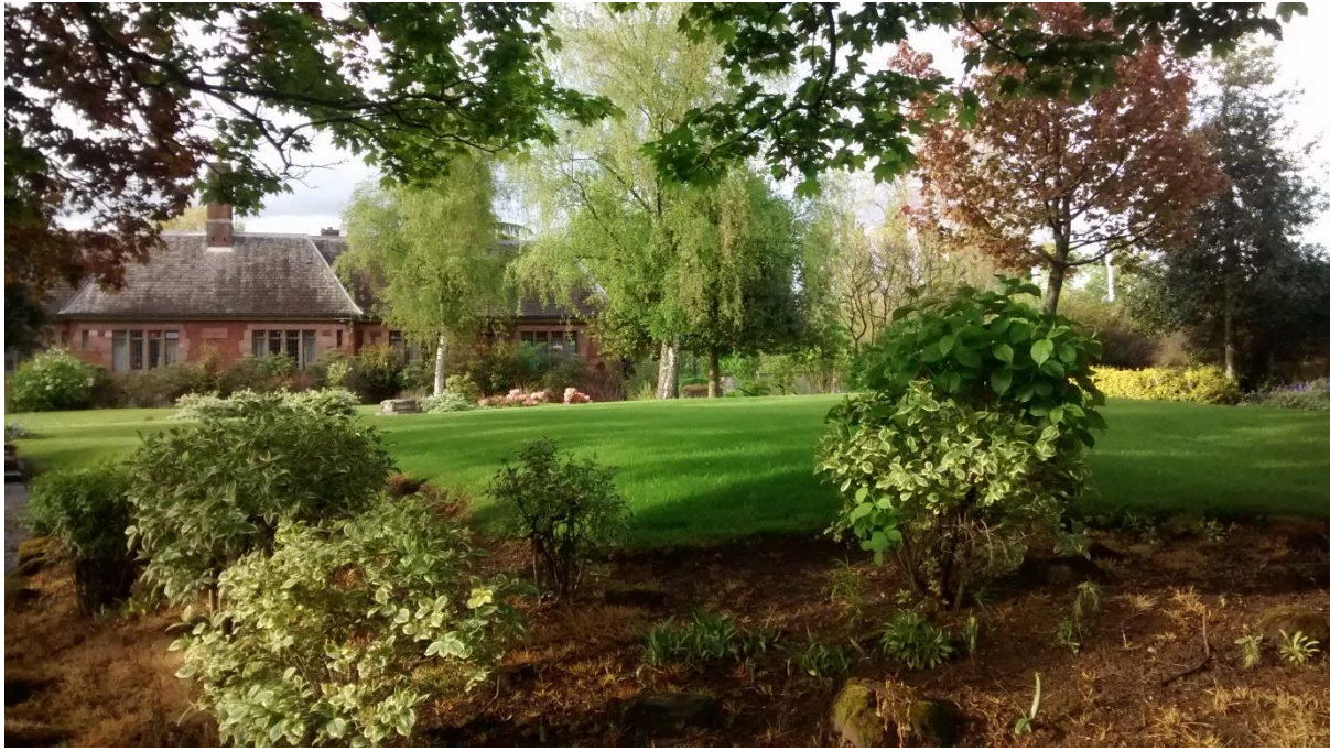
Part of Lady Herbert's Garden, pictured last summer, showing almshouses built in 1937