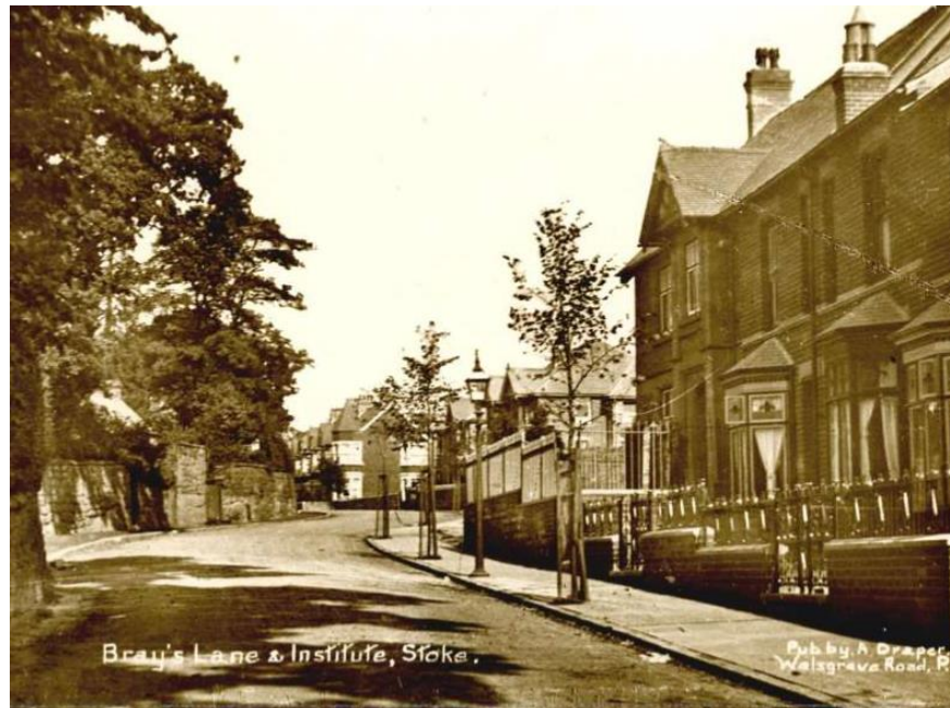
The Parish Rooms (or Institute) can be seen here on the right, in a built-up Bray’s Lane in 1914, a scene still recognisable today